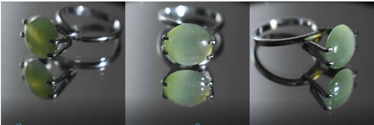
Figure 3: Composite picture of cut ring stone (JLCC7). Stone is 11.6 mm by 12.5 mm in diameter and weighs 0.94 grams/4.7 carats. While chatoyant or “cat’s eye” Jades (both nephrite and jadeite) have been documented before from various locations, chatoyancy refers to a band of light caused by reflection along inclusions or parallel underlying fibers within the stone. It is not associated with an actual change of perceived color for the body of the stone itself.