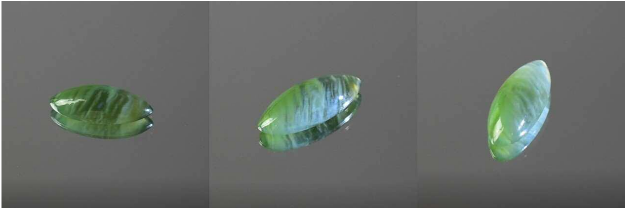
Figure 5: Composite picture of cut stone (JLCC10). Stone is a 17.1 mm by 7.4 mm marquise cut cabochon and weighs 0.7 grams/3.6 carats. High vitreous luster, high translucency in bands, and sharp color changes from dark to light greens and light blues.