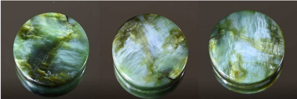
Figure 2: Composite picture of cut stone(JLCC4). Stone is 36.6 mm by 36.1 mm in diameter and weighs 33 grams/165 carats.