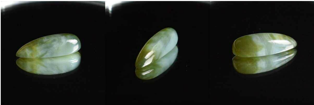
Figure 6: Composite picture of cut stone (JLCC9). Stone is a 23.5 mm by 7.8 mm drop cut cabochon and weighs 2.13 grams/10.6 carats.