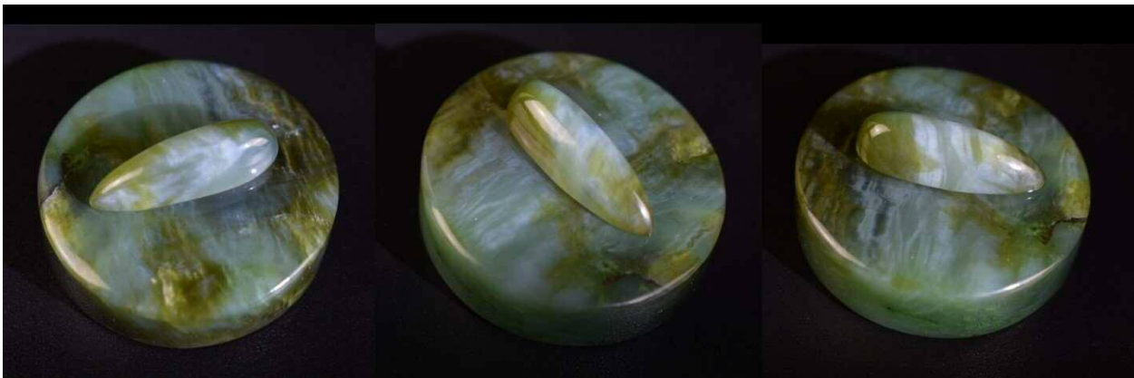
Figure 7: Composite picture of cut stones JLCC4 and 9 as also seen in motion exhibiting the change in color in our video "Change in the Jade World".

Identification work conducted to date on this material from surface samples relied heavily on SEM/EDS (Scanning Electron Microscope/Energy Dispersive X-Ray Spectroscopy) as well as thin section and hand sample microscope work to understand the relationship to perceived color to the main mineralogical characteristics of the nephrite Jade itself.