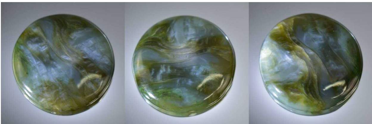
Figure 1: Composite picture of cabochon cut stone (JLCC5), showing the color change as the stone is rotated relative to a fixed light source. Stone is 36.5 mm by 35 mm in diameter and weighs 17.6 grams/87.9 carats.

Figures 1 to 7 below show a series of cut stones from Jade Leader’s 100% owned DJ project which display color and texture variations on this color change phenomenon. While still photographs can illustrate how colors are seen from static viewing angles under daylight LED studio conditions, movement is needed to reveal the dramatic shimmering dramatic color transitions. Readers are invited to watch a special video of the stone’s full visual effects presented in our latest Youtube Channel video “Change in the Jade World” here .